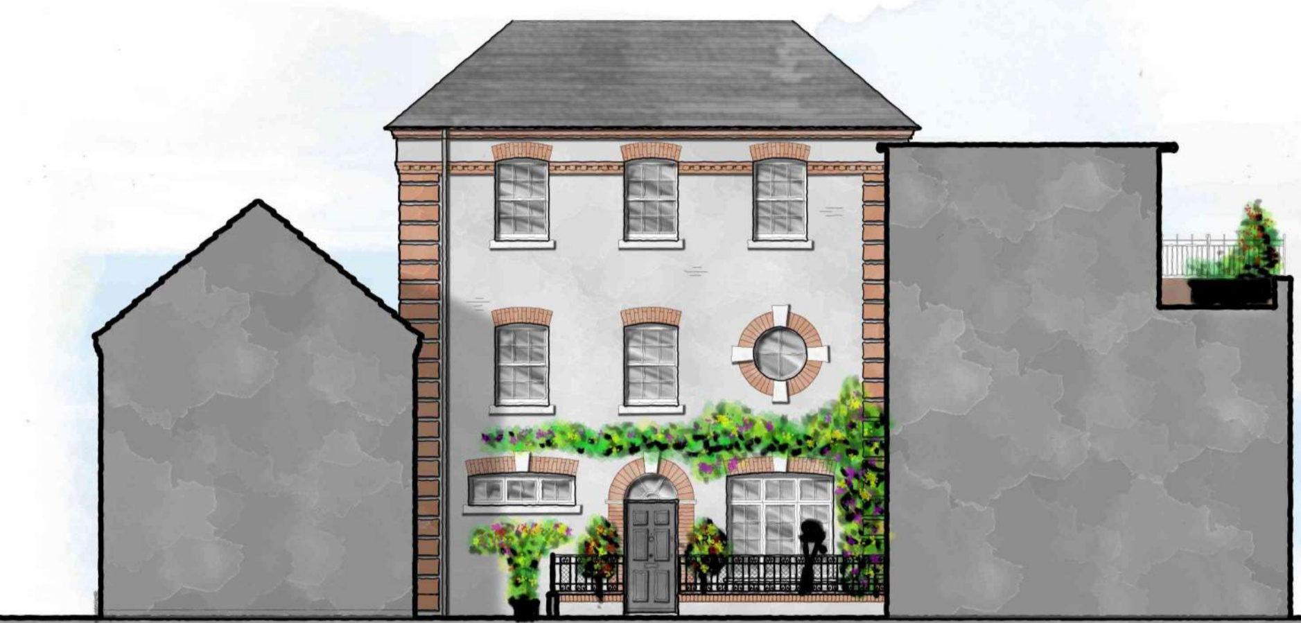
ARTIST'S MEWS (South) ELEVATION. 8 AM