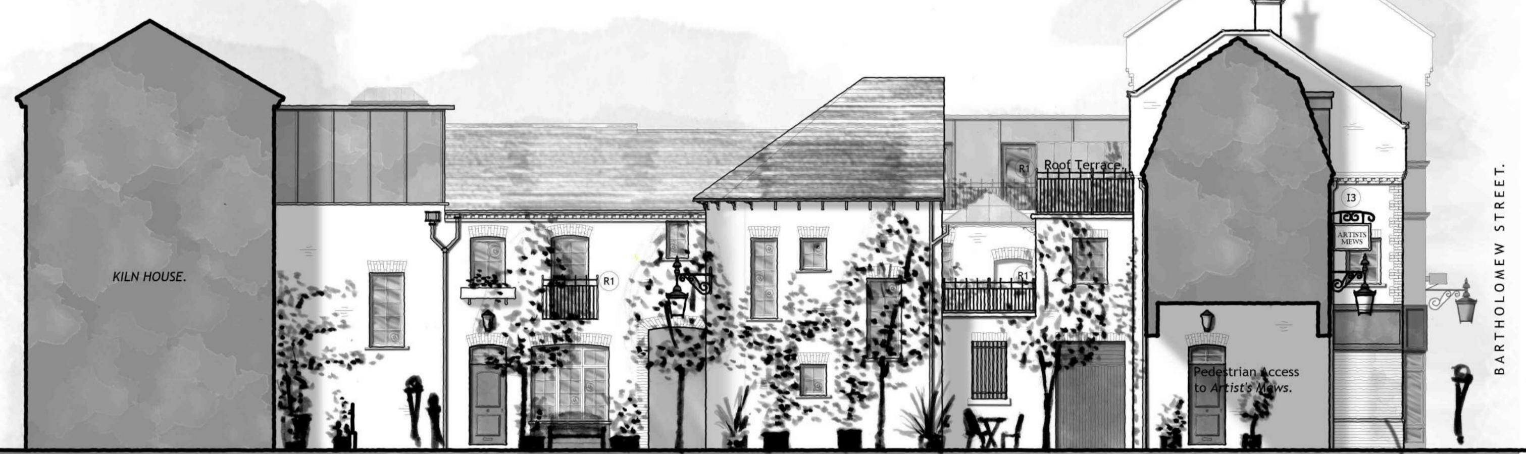
ARTIST'S MEWS (South) ELEVATION. 9 AM