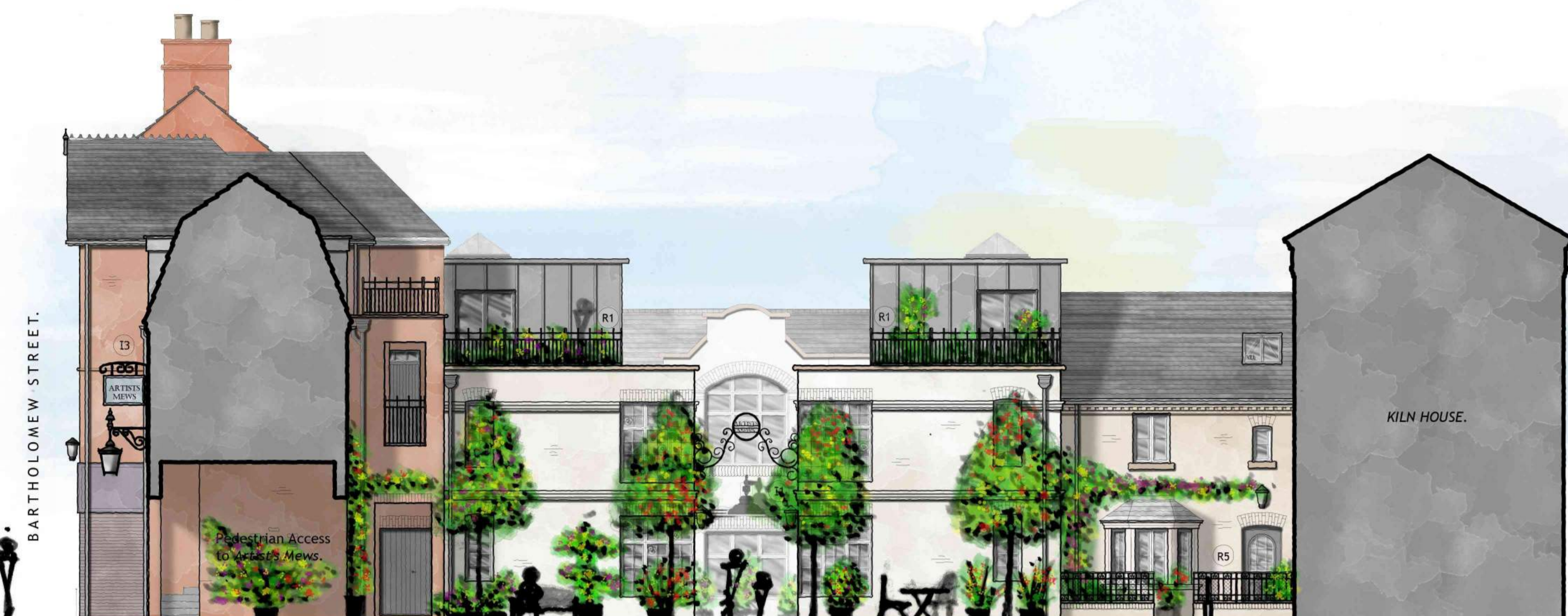
ARTIST'S MEWS (South) ELEVATION. 6 AM