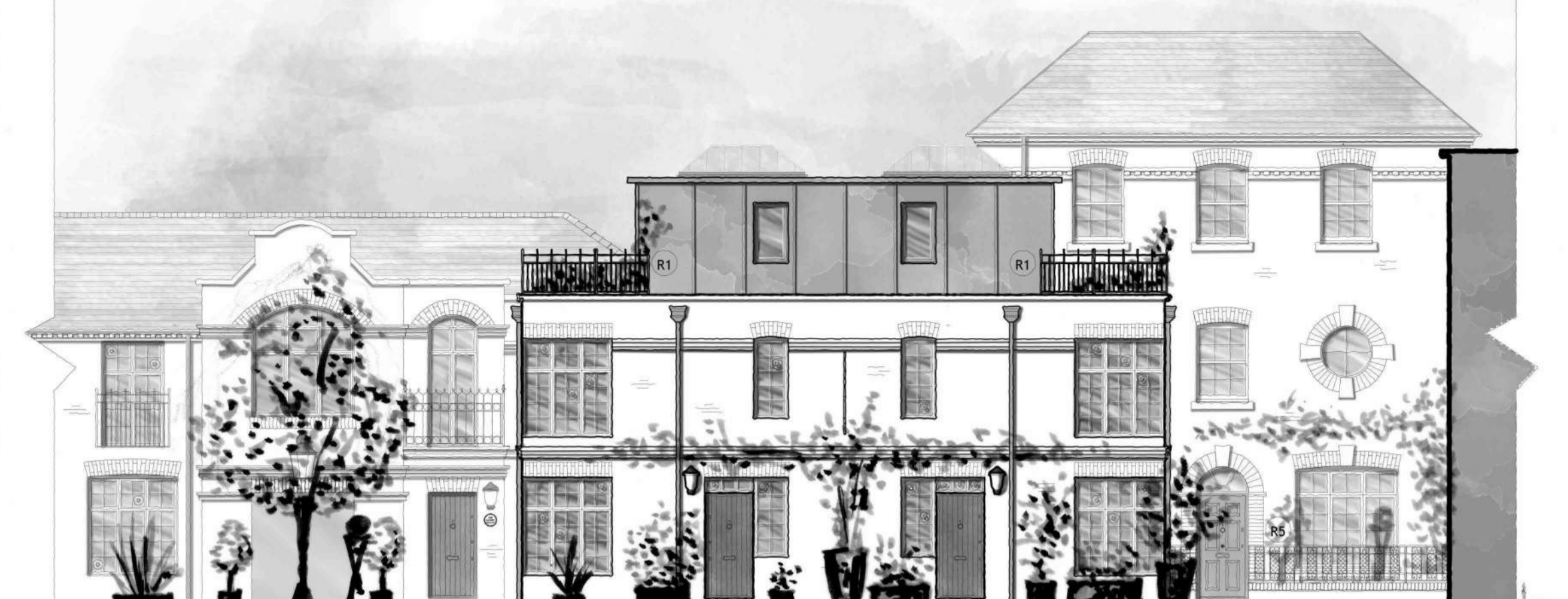
ARTIST'S MEWS (South) ELEVATION. 7 AM