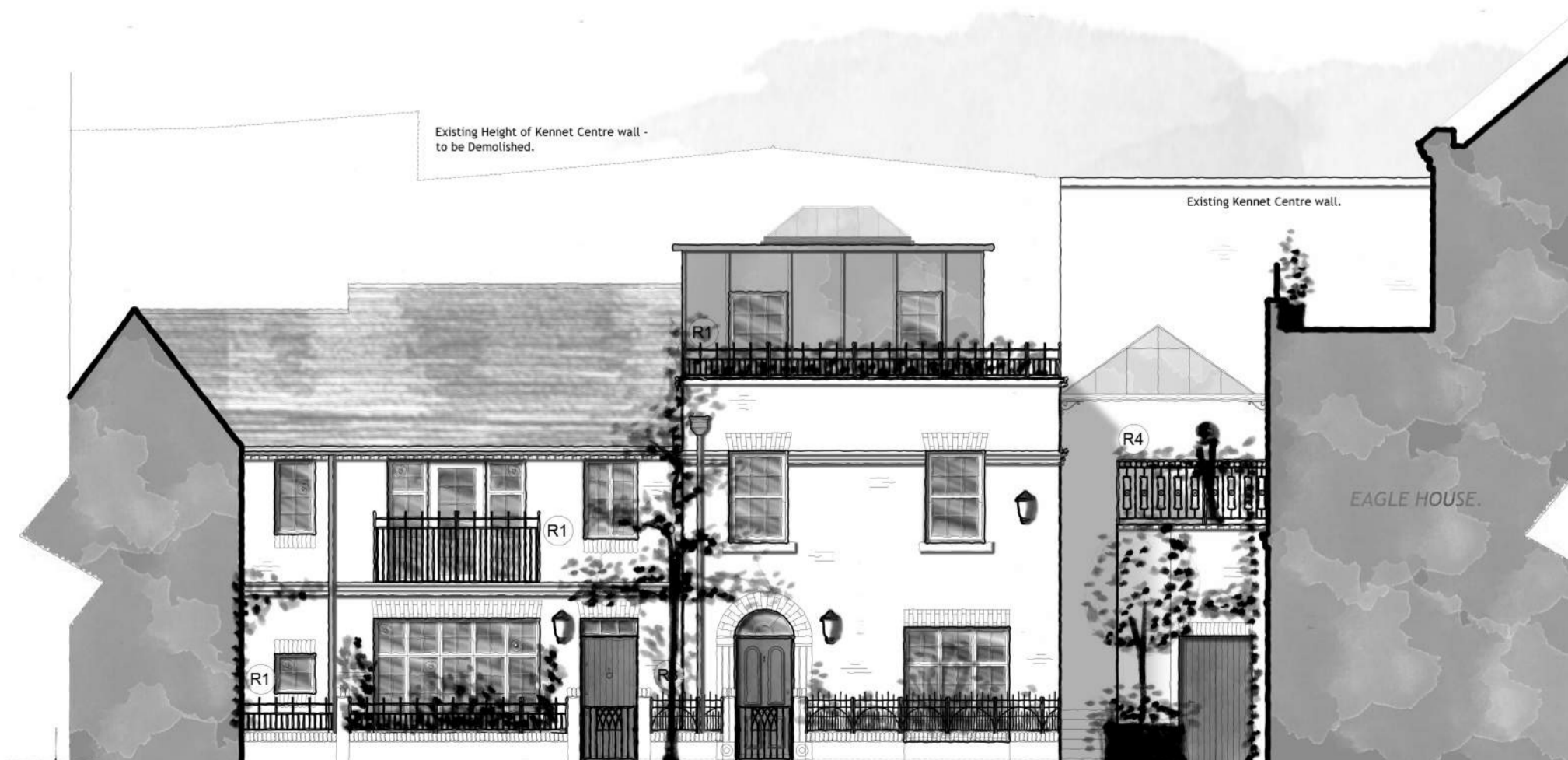
EAGLE YARD ELEVATION. 4 EY