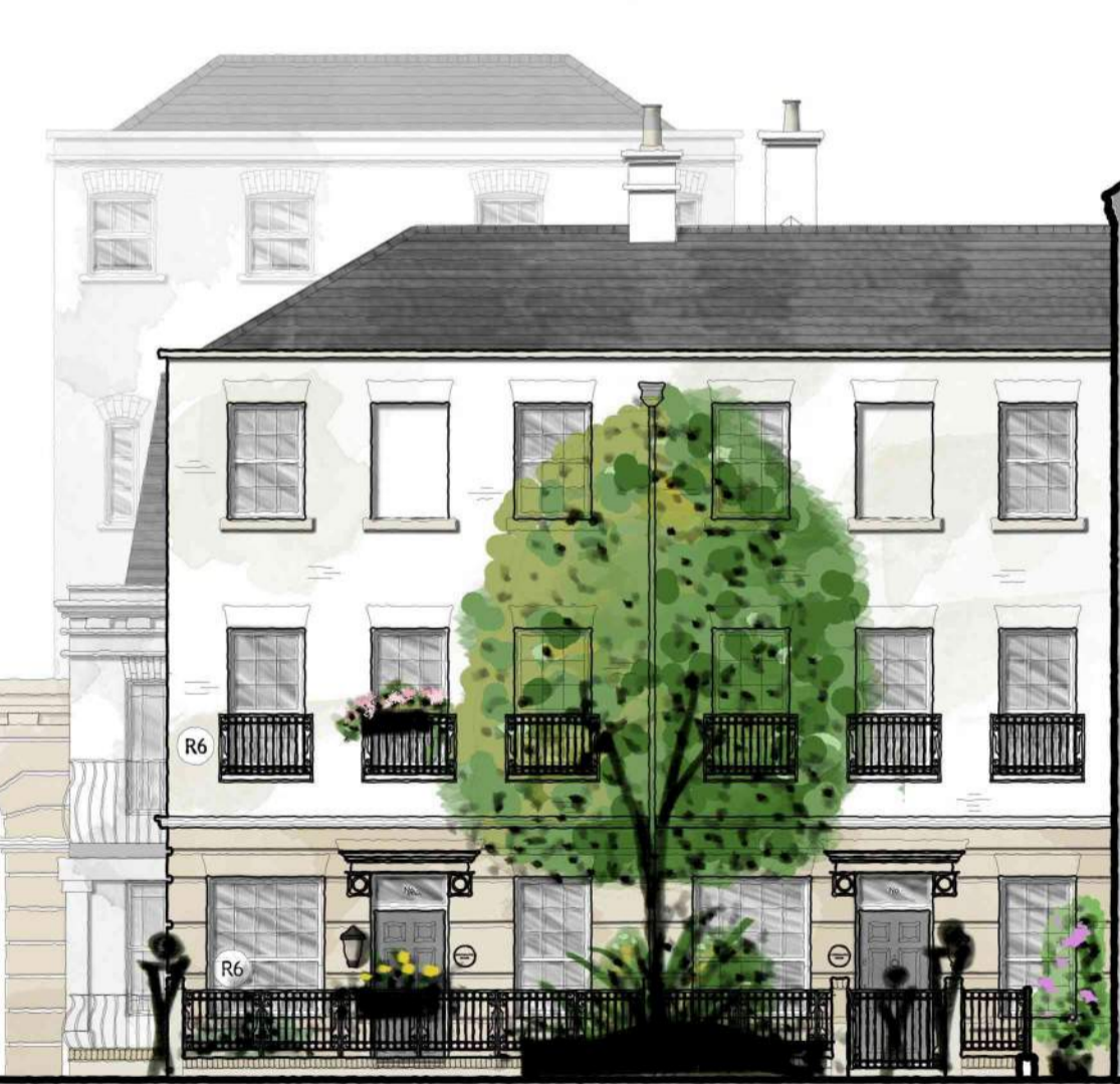
Whitesmith House (Front Elevation)