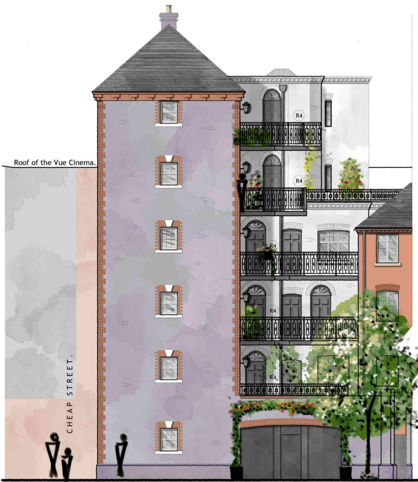
Craven House, (Side Elevation) Refuse Store.