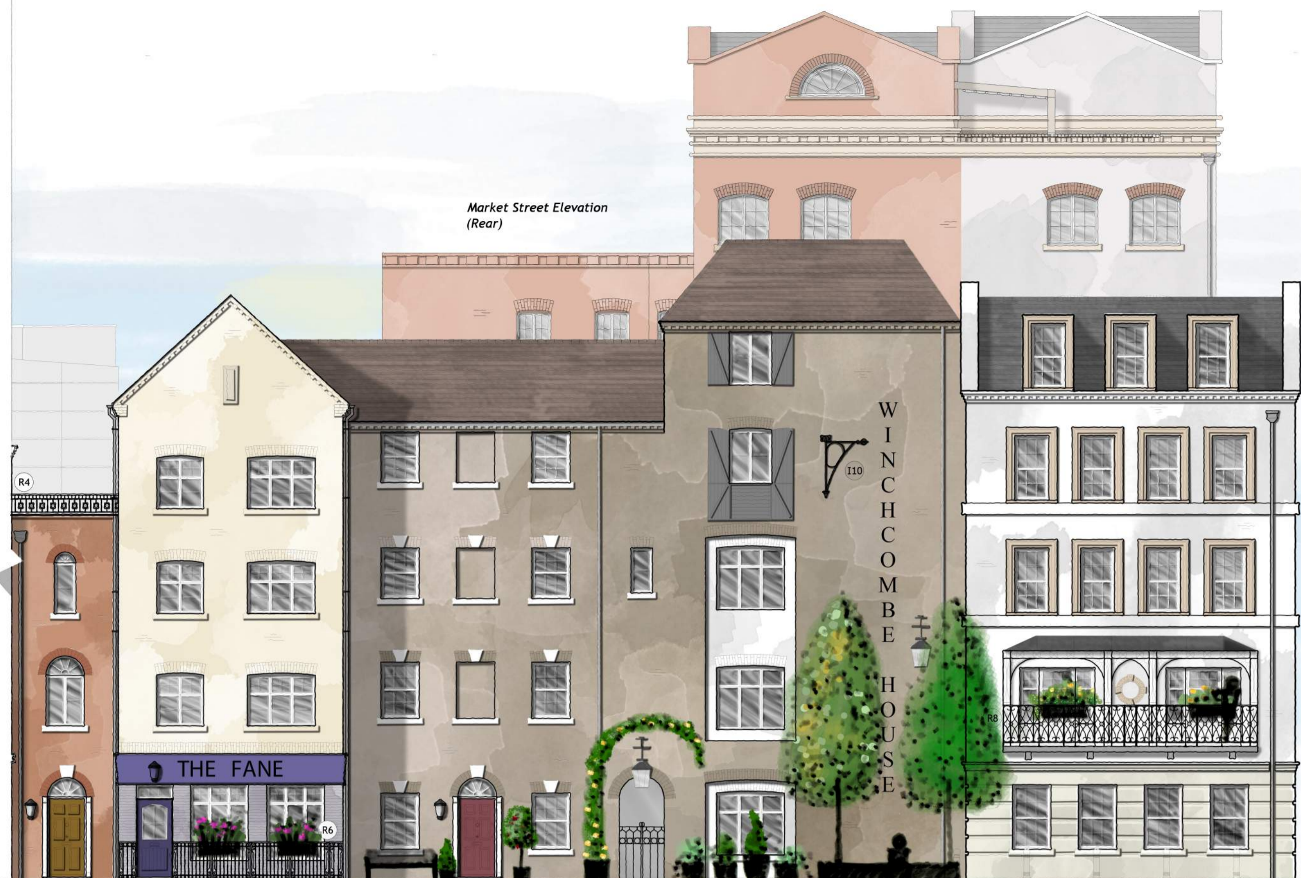
THE FANE. (Front Elevation) PLENTYS PLACE ELEVATION. 9 PP