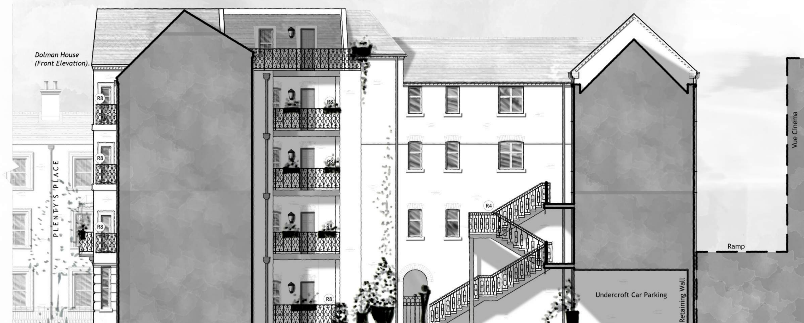
IRON YARD ELEVATION. 4 IY