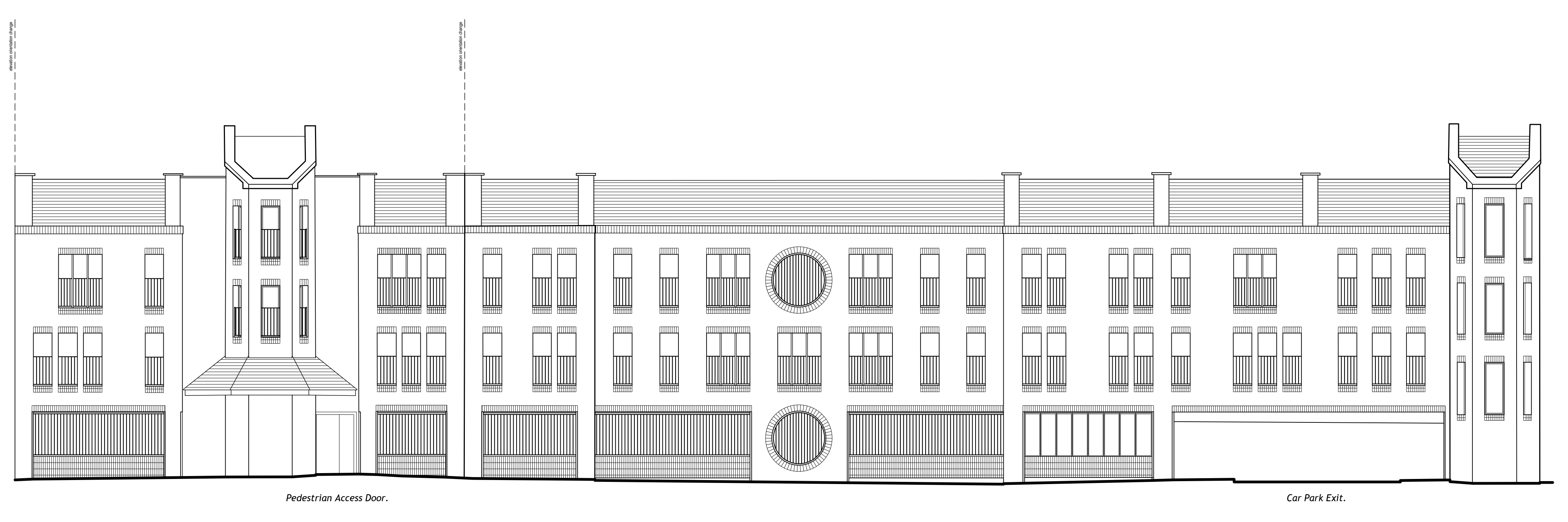
MARKET STREET ELEVATION.