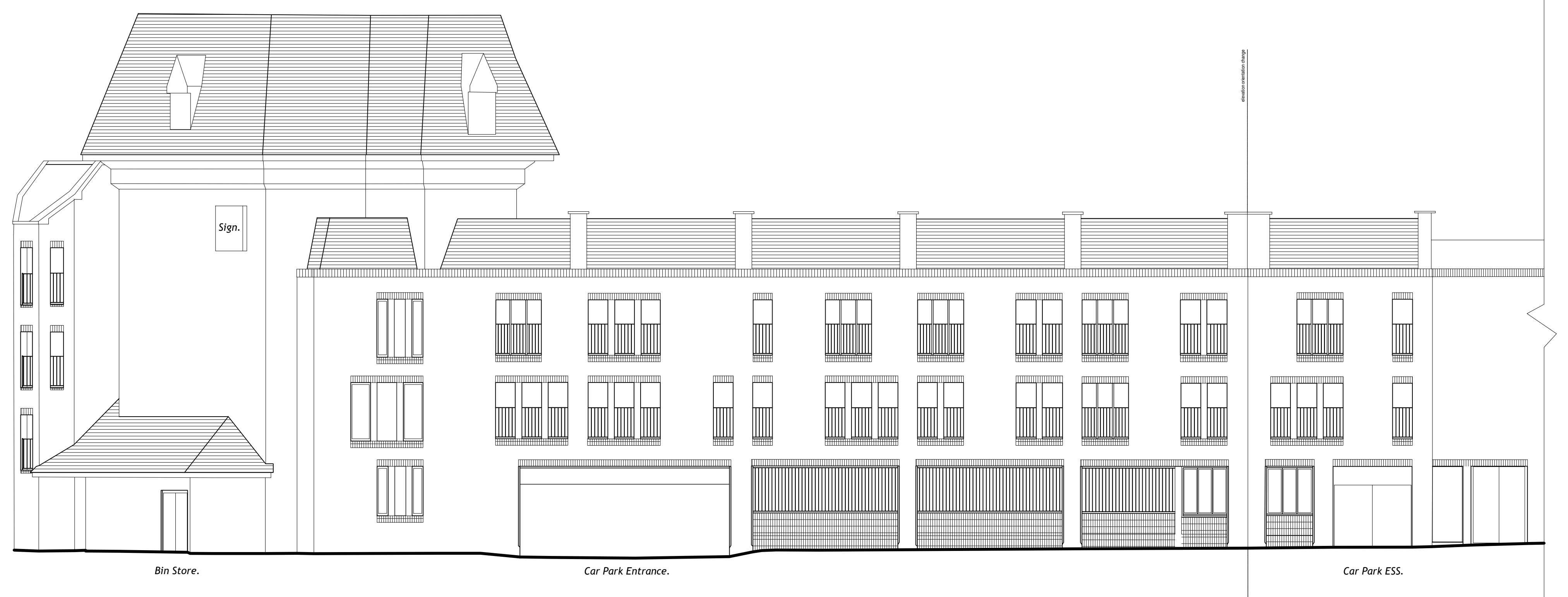
BARTHOLOMEW STREET ELEVATION.